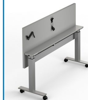
Removable Handle Shown in Stored Position.