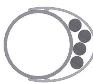
3/8" POWER CORDS