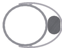
FLAT OVAL CONDUIT