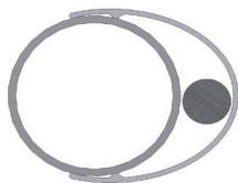
1/2" ROUND CONDUIT