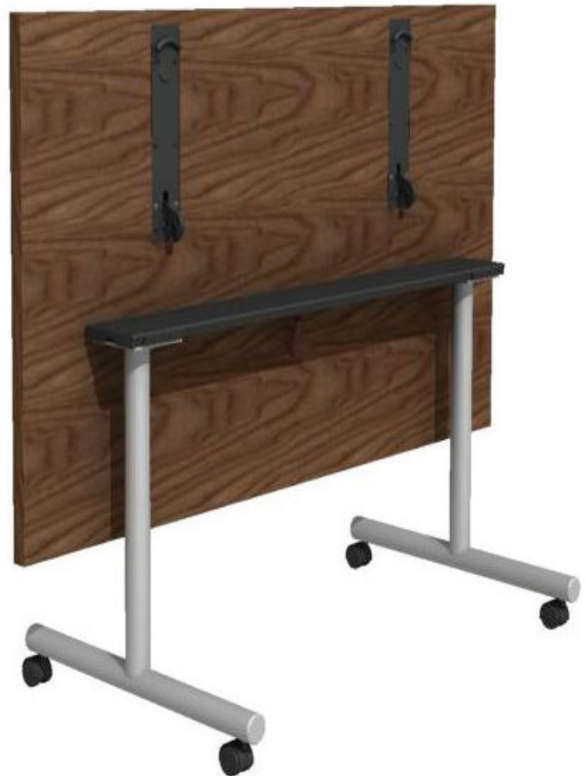
Shown above is the Dual Leg Nester Mechanism on a 101 base, with double latch application. Qty 1 NS-36x48-2P | Qty 2 NS101-26PALC